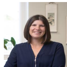
Holly Lydon Recruitment, Offshore Schools Program and HR Support